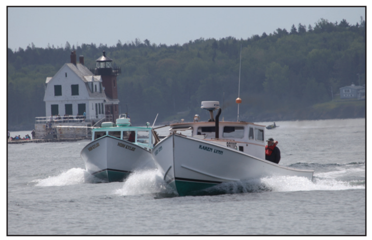
MISS KYLEE and KAREN ANN fighting for second in Diesel Class B at the Rockland Lobster Boat Races.

Cameron Crawford's WILD WILD WEST [West 28; 1,050-hp Isotta]. When she came to the prize float it was learned that she was done for the day as a part in the fuel system had been put in wrong and she could not reach top end, but she would be ready for Rockland the next day.